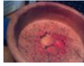
Pyrography: Burning Pictures into Wood by Goodhart