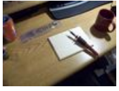
Intro to Wood Burning by hidethecake