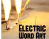
Burning Words Into Wood With Electricity by austiwawa