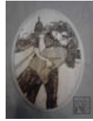
Wood Burning Portrait by ecsaul23